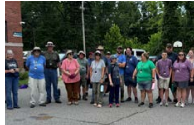
Pictured above and to the right are pictures from Send Relief a wonderful organization that volunteered and helped us out so much this summer. Thank you!