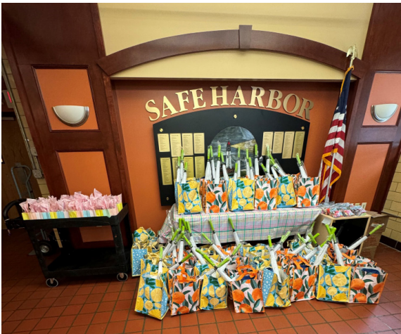
Pictured above are gift bags for the survivors given during the Mother's Day luncheon.