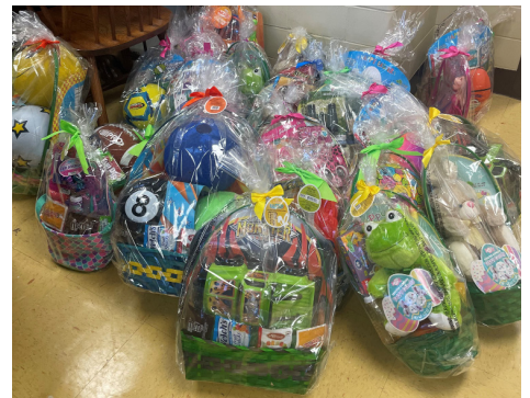
Pictured above is Easter baskets donated by Ironton Church of Christ.