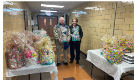
Pictured above is a donation from Legacy Baptist Church. They donated 40 Easter Baskets.