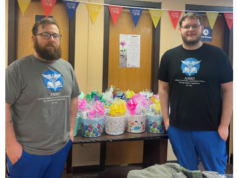
Pictured above is ACTC's Nursing Program ANSO that donated children's Easter baskets and filled Easter eggs.

Thank you to the wonderful donors who donated Easter baskets and supplies so our kids at Safe Harbor could have a wonderful Easter!